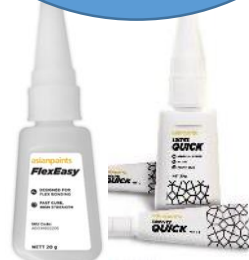
FlexEasy /Loc Quick